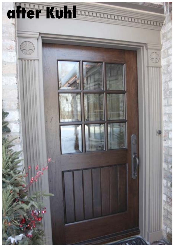
Door specifications: 2.5" thick black American walnut, double beveled insulated true divided lights, mortise and tenon construction with locking dowels. Worm holed, distressed finish. Rocky Mountain Hardware handle set.