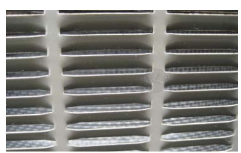
Up close look at the metal louvers